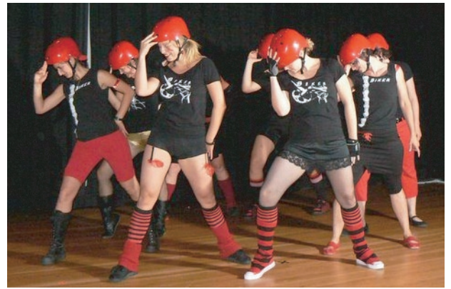
B:C:Clettes bring 'Sexy Back' at Rouge et Noir: A Bicycle Cabaret. Vancouver, BC. July 2007.