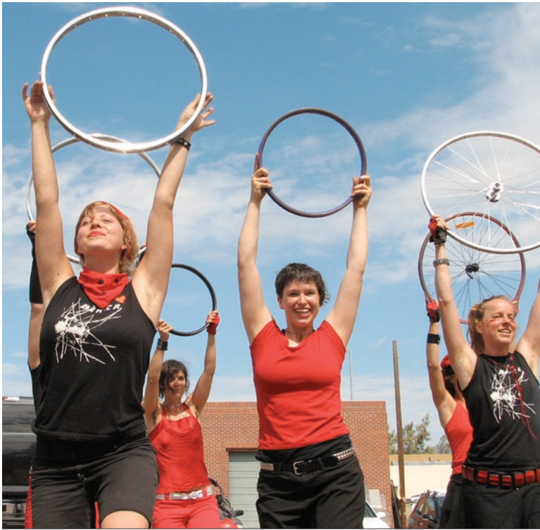
B:C:Clettes perform 'Love Story' in San Luis Obispo, CA. August 2007