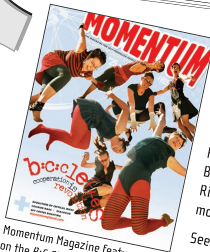
Momentum Magazine feature story on the B:C:Clettes. Dec 2006.