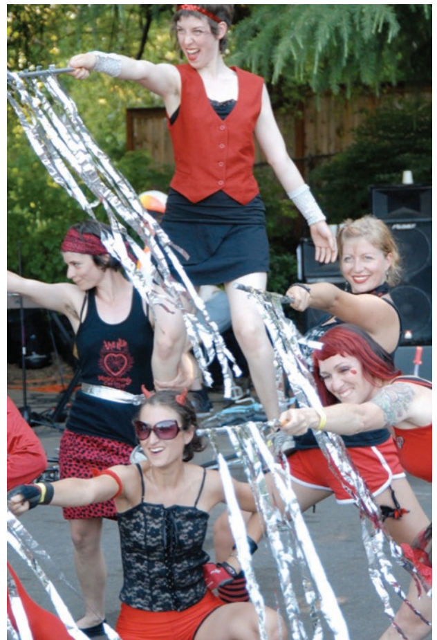
Performance of The Clette-a-festo at the Multnomah County Bike Fair. Portland, OR. July 2008.